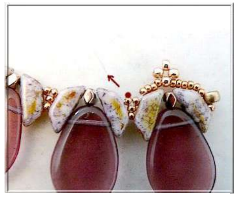
16) Repeat steps 12 through 15 until the end of the row.