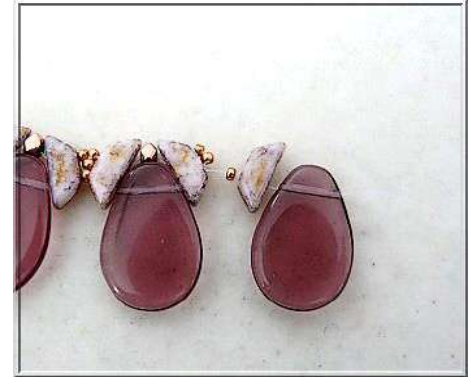
10) Repeat steps 6through 9. Add a total of13 petals.