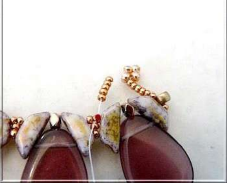
14) Pick up 5 SB15 and pass through the SB15 (red point).