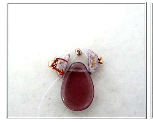
4) Pick up 1 MH3 between the Tinos®. Pass through the first Tinos® (top hole), SB15, SB8, SB15 and the second hole of Tinos®.