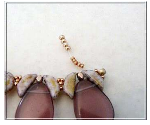
12) Pick up 5 SB15 and 4 SB11.

11) In the last Tinos®, add 1 SB15, 1 SB8, 1 SB15 and pass twice through the last beads to strengthen. Go out through the second SB15 added.