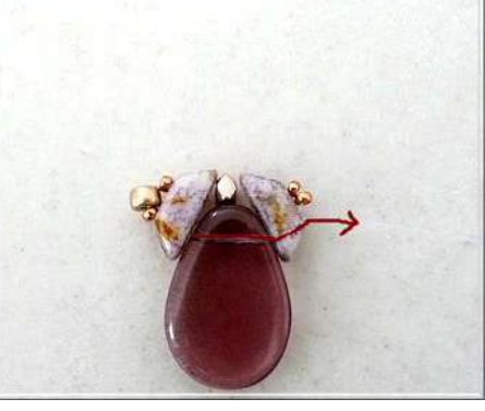
5) Pass through the PE and the second Tinos® (bottom hole).