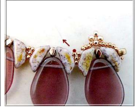
15) Pass through the next SB15 (red point).