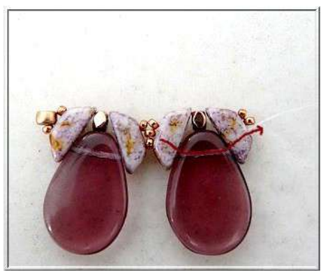
9) Pass through the third Tinos® added (bottom hole), PE and the next Tinos® (bottom hole).