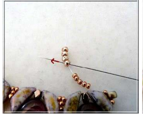
13) Pass through the first SB11 to make a loop.