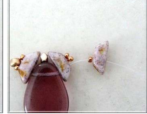
6) Pick up 1 SB15 and 1 Tinos®.