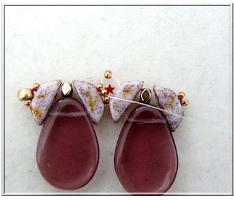
8) Pick up 1 MH3 and pass through next Tinos® (top hole). Add 1 SB15 in the middle SB!