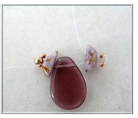
3) Pick up 2 SB15 and pass through the second hole of the Tinos®.

2) Pick up 1 PE and 1 Tinos® (bottom hole).