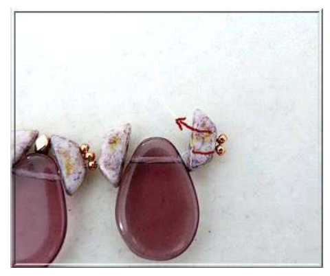
7) Pick up 1 PE, 1 Tinos®, 2 SB15 and pass again to the last Tinos® added (top hole).