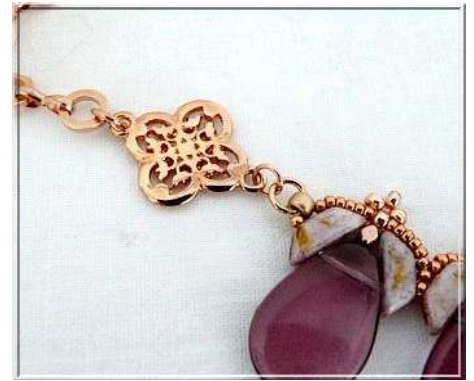
17) To finish, add the jump ring, the spacer beads, the lobster clasp ant the chain.

Happy beading! Thank you for respecting my work © Puca - August 22, 2017